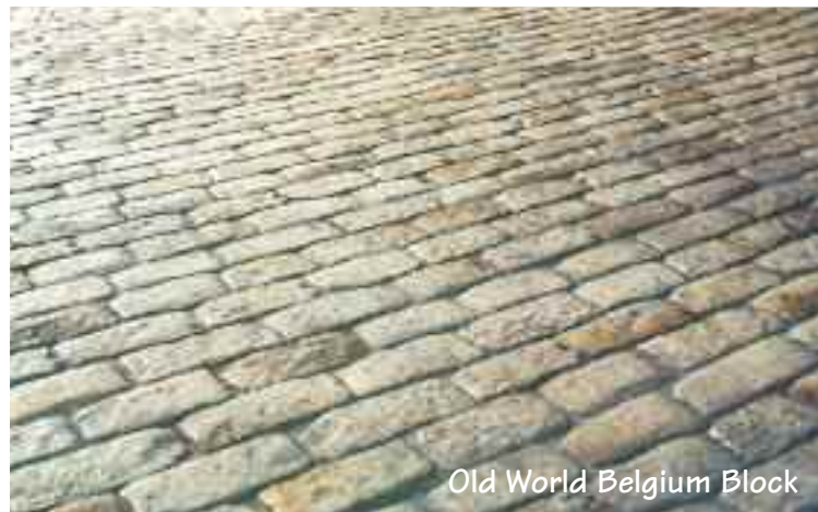
Old World Belgium Block