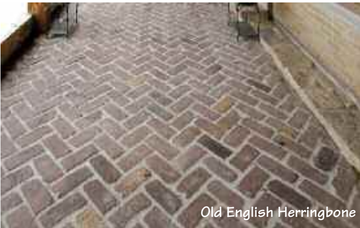
Old English Herringbone