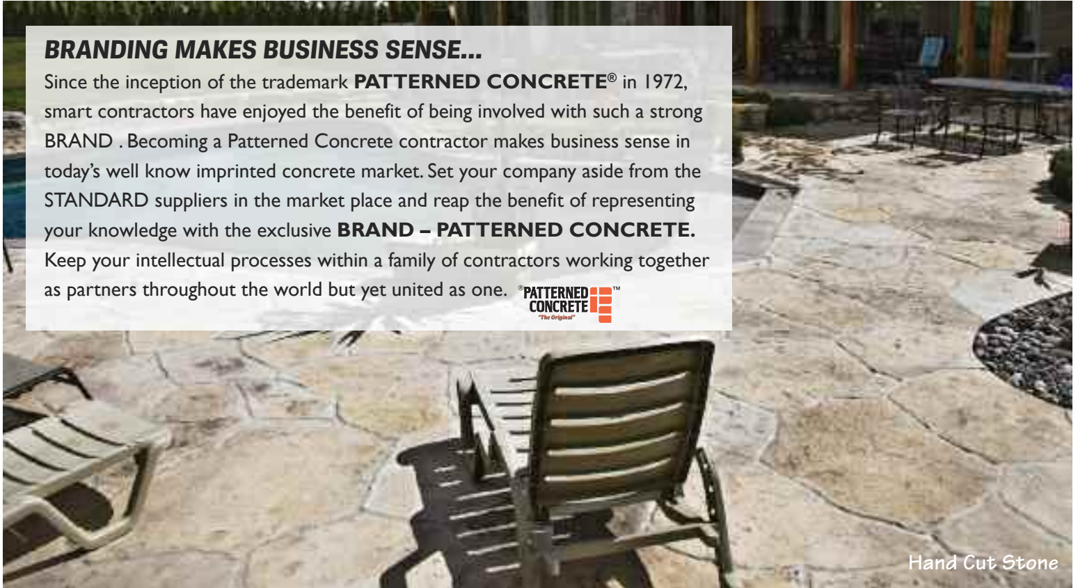
Hand Cut Stone